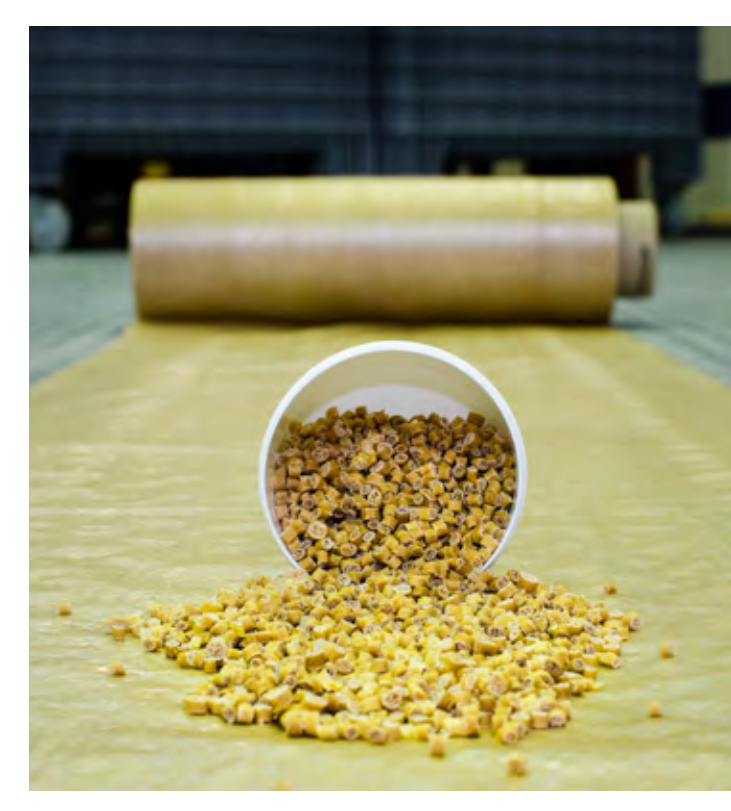
Testbatch foil and granules based on chitin

In developing an antimicrobial film containing chitosan, the researchers of the ChitoSmart project were faced with some considerable challenges from the very start. 'Mixing the antimicrobial chitosan into the plastic film continued to cause problems,' explains Hilbrink. 'It was impossible to distribute this substance homogeneously. It remained lumpy in the film, possibly causing it to lose its antibacterial effect.' The chitosan also appeared to adversely affect the film, causing a yellowish discolouration after the substance had been mixed in.